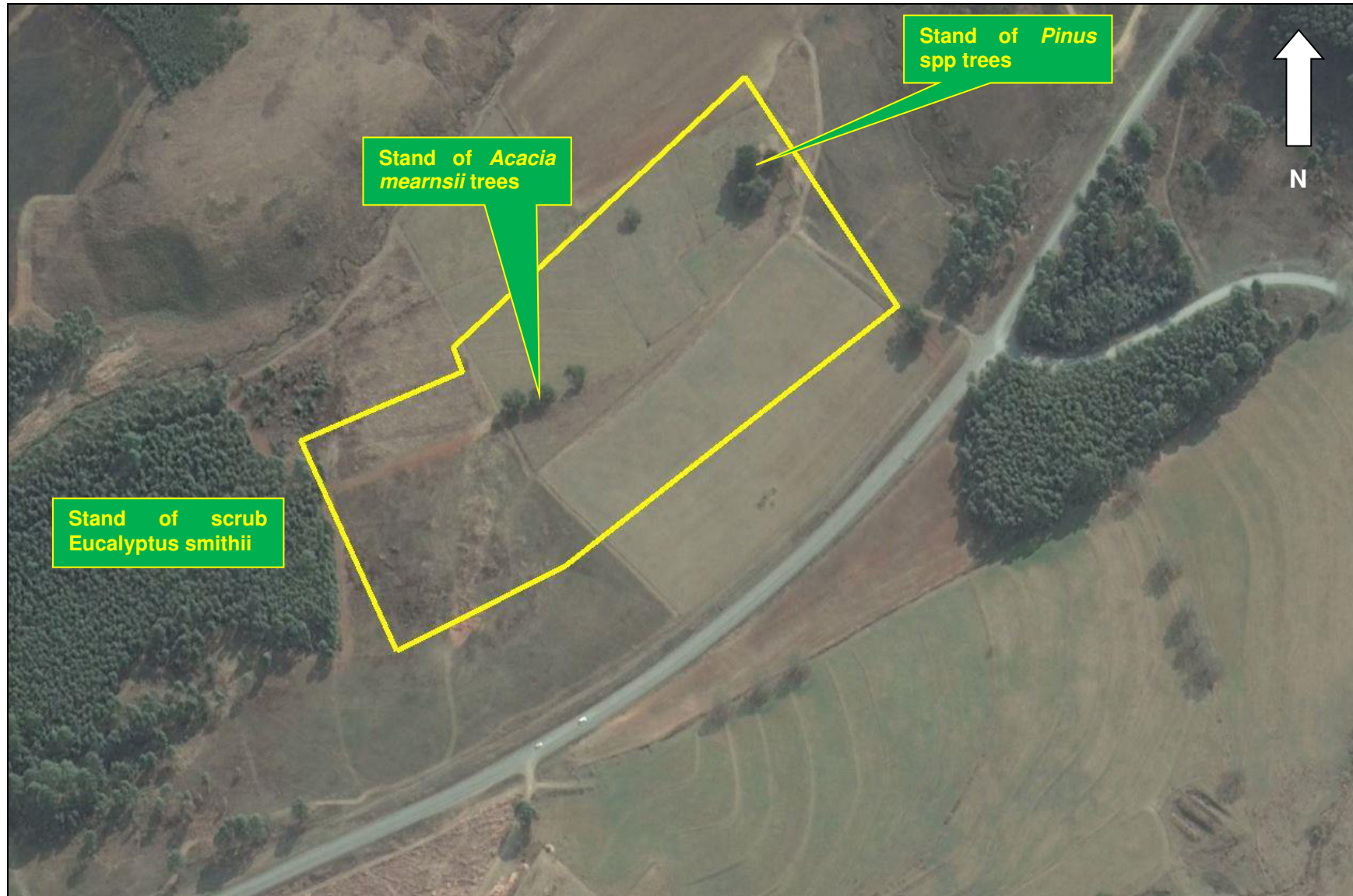
Figure 2: Aerial view of the site and surrounding areas