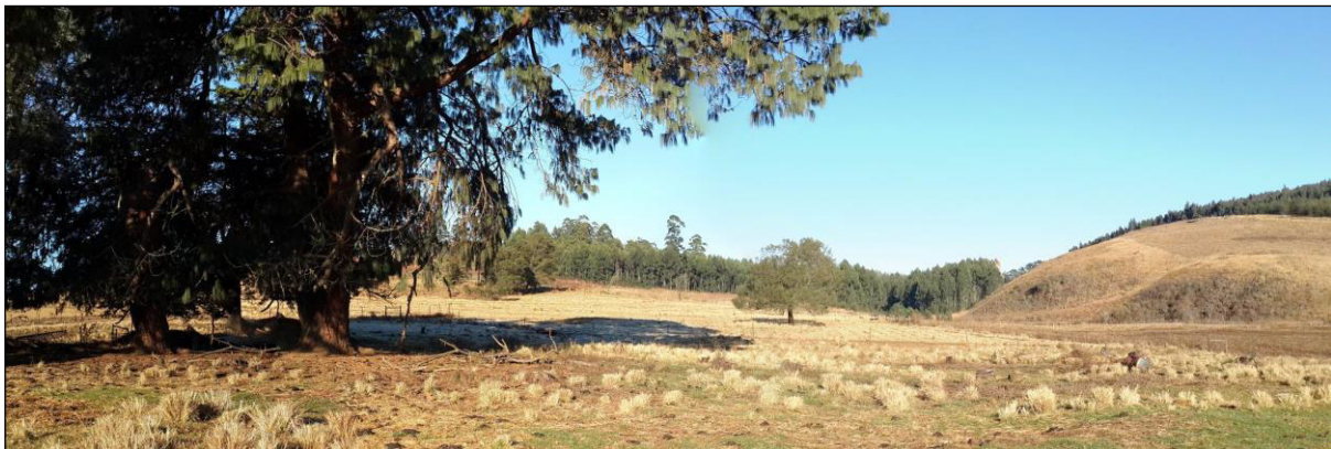
Plate 2: View of the clump of Pinus spp on the site