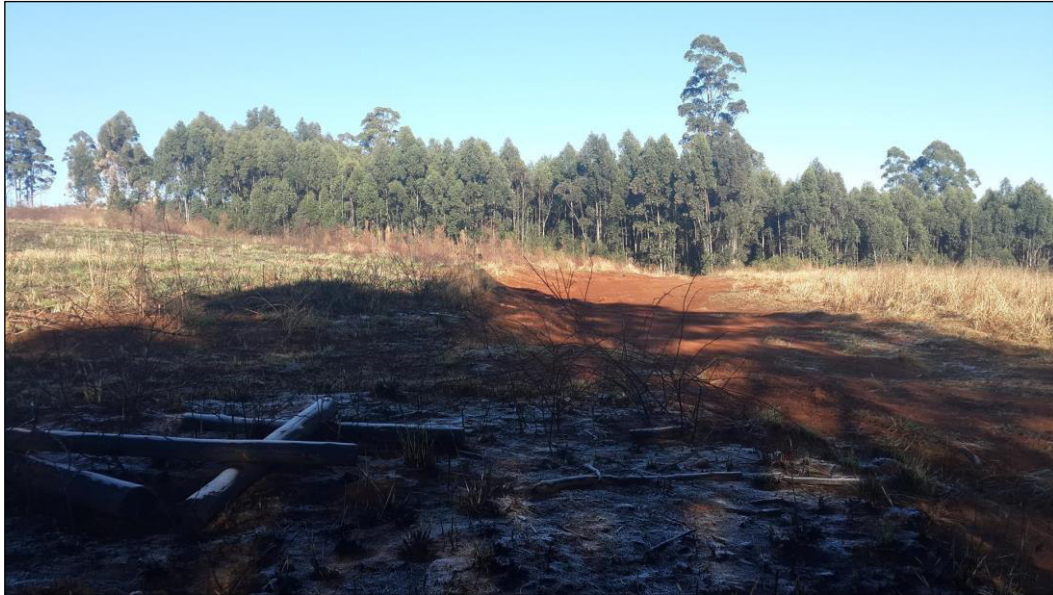
Plate 1: View of the scrub Eucalyptus spp on site

Figure 2 below provides an aerial image of the site that the Breeder facility is to be located upon. Please note that the yellow line in Figure 2 indicates the outer boundary of the development footprint.